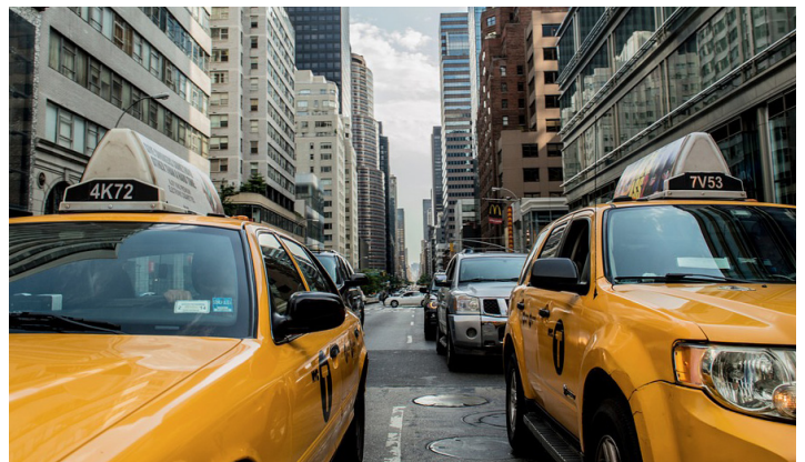
Here the background is in focus so we can see the busy street behind and get a better sense of location.