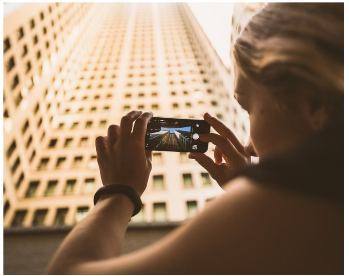
This building is wide, so it looks better in landscape.