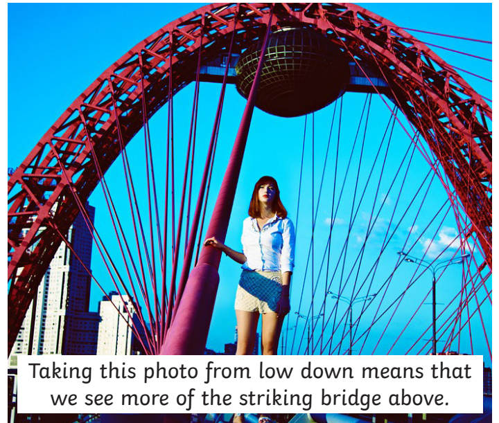
Taking this photo from low down means that we see more of the striking bridge above.

5. Experiment with angles. Don't just take a photo from where you are standing. This might be right for some situations but you can be more adventurous with your shots. Try a shot while squatting down or holding your arms up high and shooting down on the subject. Try from one side or the other, or even from behind. You may be surprised at how much better a photo can be just by varying the angle.