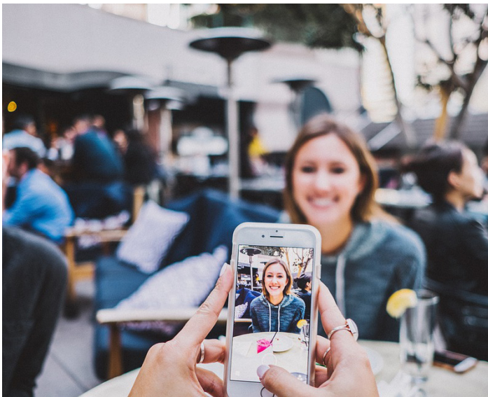
This lady sitting at a table looks better in portrait.