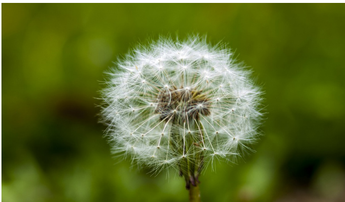
Here the background is blurred, which is called a small 'depth of field'. This means that we really focus on the dandelion.

You might also want to change some settings to decide whether you want the background in focus or blurred. Look at how it can change a shot.